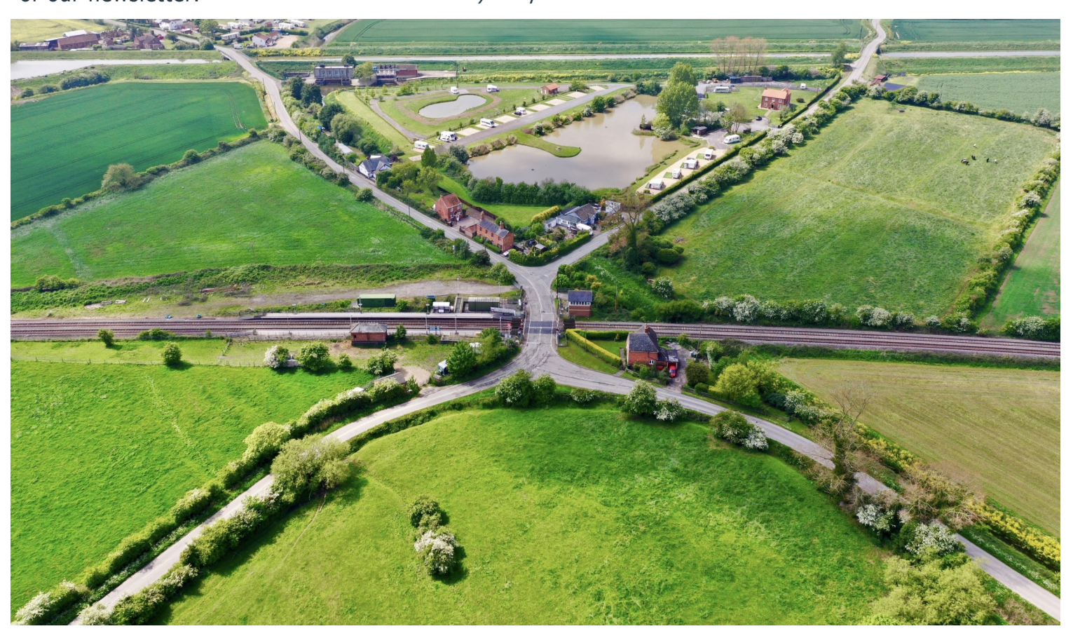
How would you approach this complex junction using IPSGA? Railway Station, Thorpe Culvert near Wainfleet

Advanced Test Passes & Online Events Programme