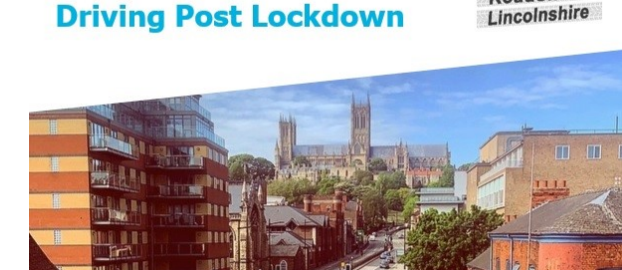
Elliot first PCC candidate to pass advanced test

Joining information is available on the Events section of our website.